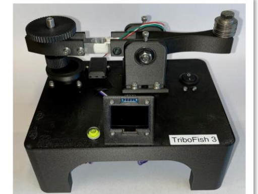
3D printed Tribometer